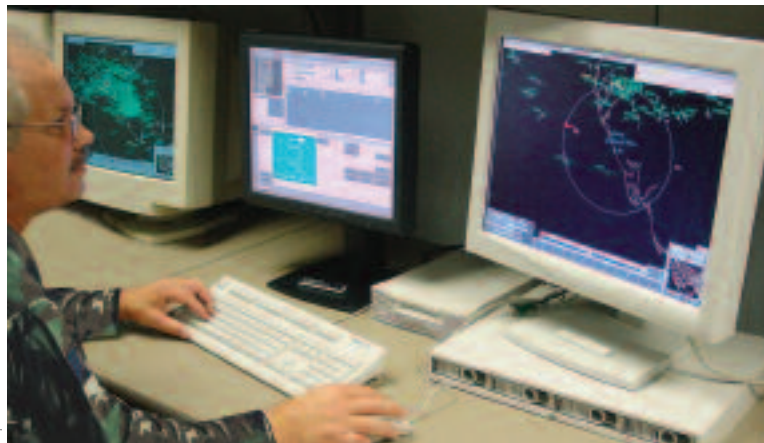
Operators work in an office-like environment without special lighting or other restrictions